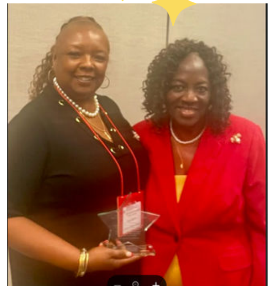
President's Forward Award