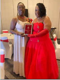
Winner Talent Extravaganza Southeast Region