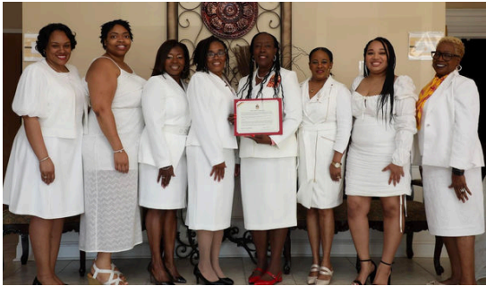
Winner Ethel Madison Award Winner Southeast Region Epsilon Kappa Chapter